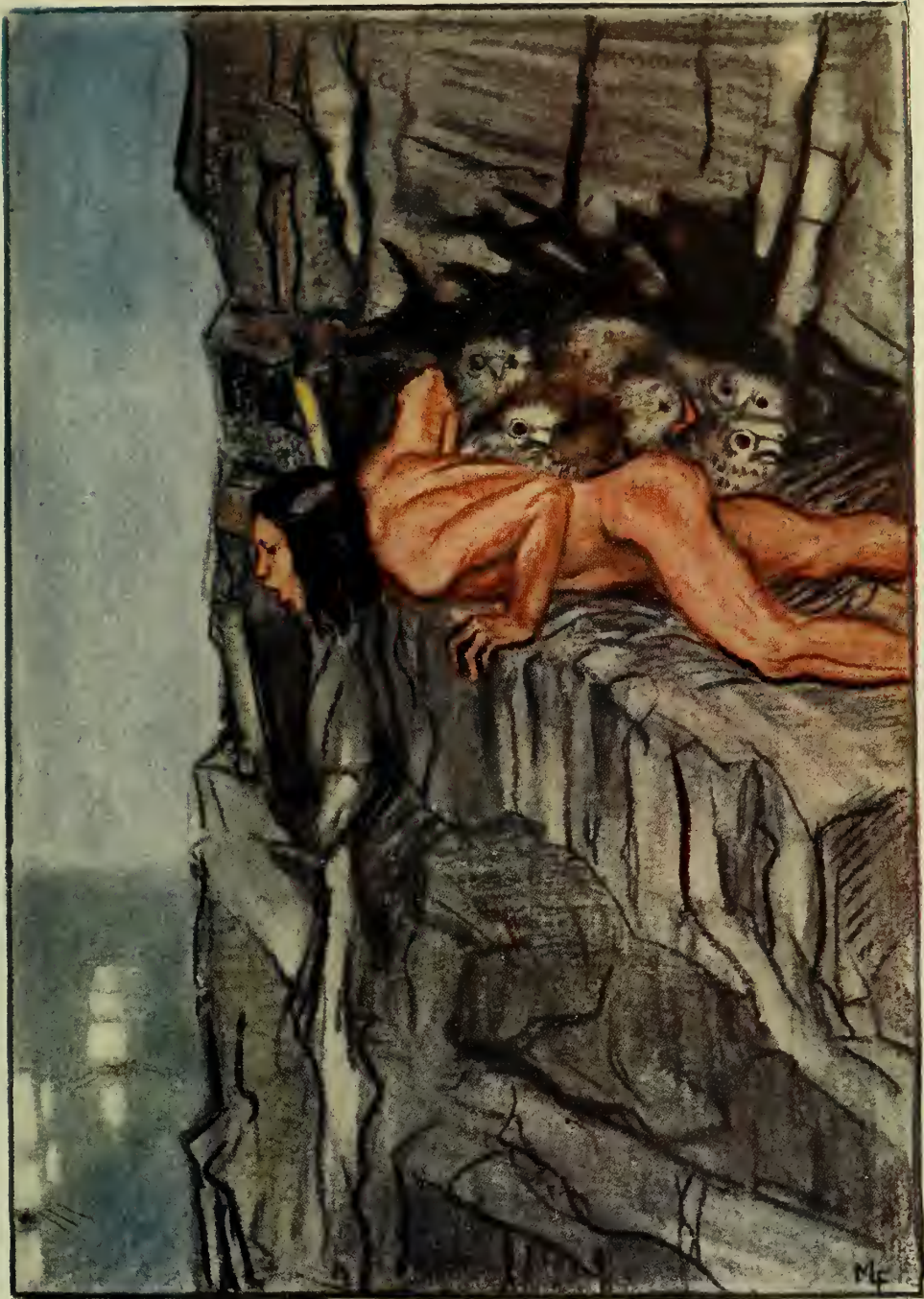
FOR SOME DAYS THE BOY LAY IN TERROR IN THE NEST . . . AND FAR OUT ON THE OCEAN HE COULD SEE GREAT SHIPS GOING BY